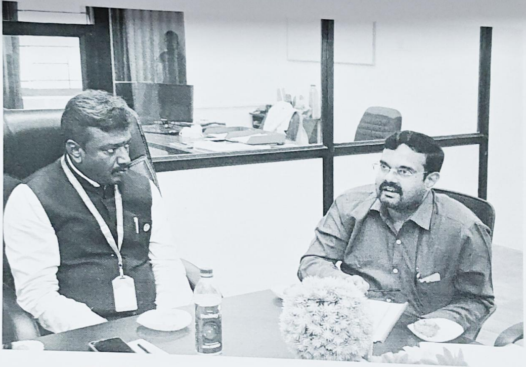
INTERNAL QUALITY ASSURANCE CELL (IQAC) Meeting on 30 th August 2024